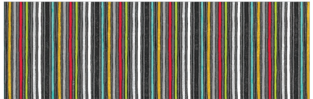
24223-99 | Barcode Stripe | Black Multi