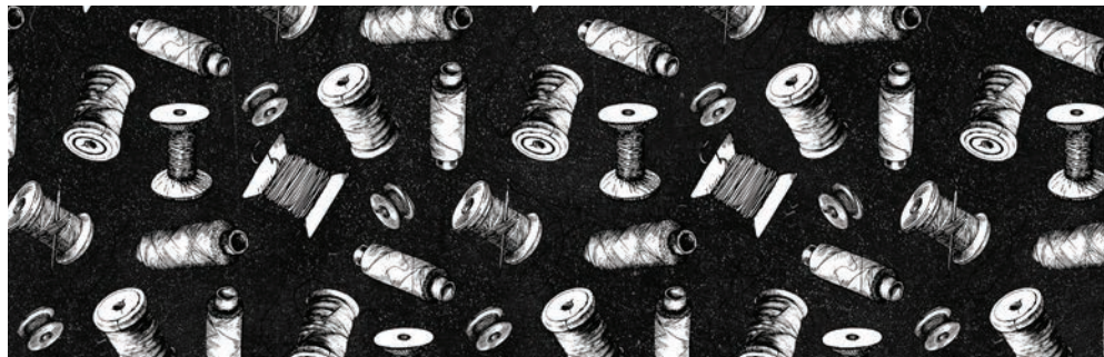
24220-99 | Spools | Black/White