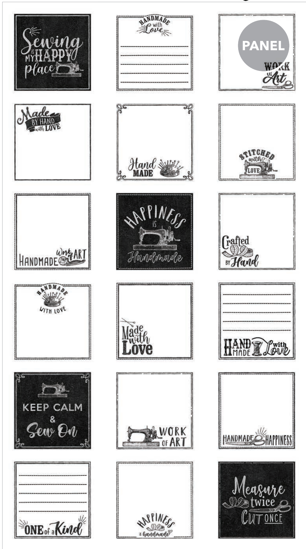
24218-10 | Label Panel | White/Black