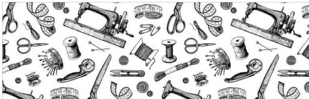
24219-10 | Sewing Peraphernalia | White/Black