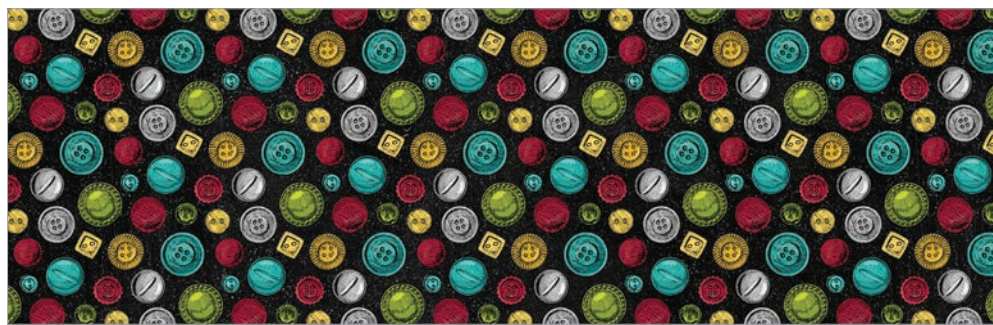
24221-99 | Colored Buttons | Black Multi