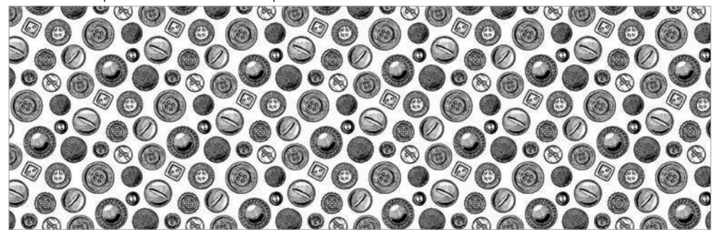
24222-10 | Tonal Buttons | Black/White